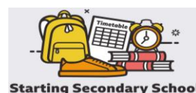
Starting Secondary School

There are several tips, articles and contributions from celebrities which could provide an interesting addition to your child's secondary transfer experience.